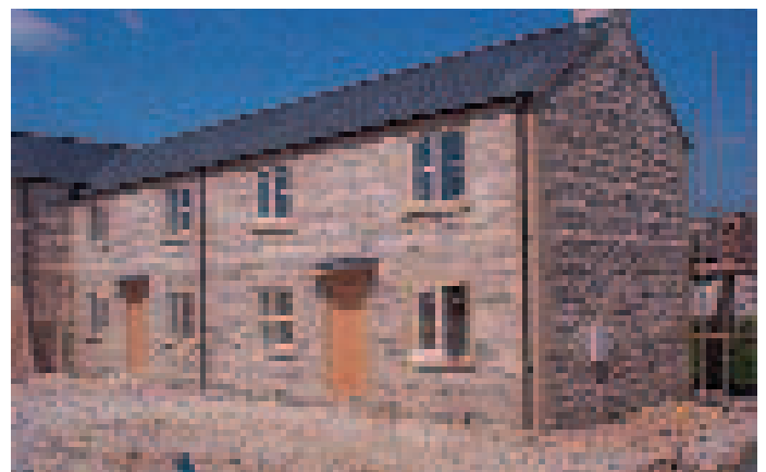
High Field Road, Bakewell

Also in Bakewell , 36 properties for rent and shared ownership are being built on High Field Road in partnership with Nottingham Community Housing Association. The 2 and 3 bedroomed family homes will be occupied in December 2005.