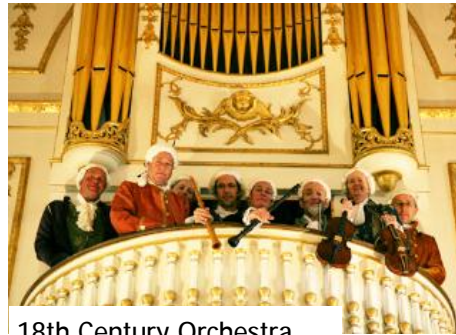
18th Century Orchestra

Orchestral and choral workshop days end with public performances and there is a special day of activities for children.